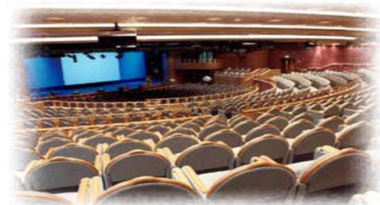
The onboard theater

The passenger can choose from a rich variety of activities like shows, movies, games etc.