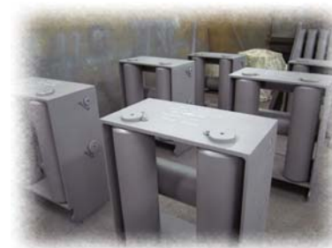
Universal roller fairleads on parade, ready for shipment. From the workshop the equipment will be transported by truck to the shipyard.

This way purchase have been made easier as the products so to speak are at your fingertips as well as the customers can cut their procurement cost.