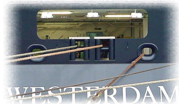
Equipment installed onboard the Westerdam

The equipment was delivered back in 1998 and when it leaves the workshop it is normally the last we see of it. The visit gave us an opportunity to see the equipment "in action".